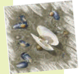
...laughing clamshell by Brian Cody

Proceeds from the event provide vital support to maintain and enhance the art collection of our town library.