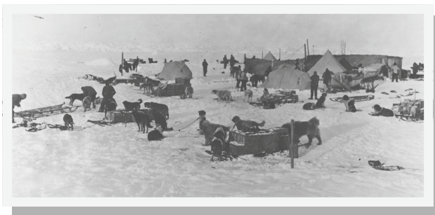
Ocean Camp on a solid floe roughly 1.5 miles from the wreck...