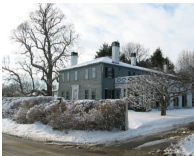
Crockett Home, Argilla Road Ipswich, Massachusetts

🍏🍏🍏 Please remember to pre-register for the Russell Orchards Tour & the Library Book Discussions.